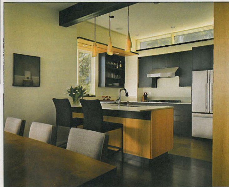
The kitchen window opens up to the view while the cabinet wall closes off a direct view to a neighbor. "It's very practical and outgoing, and I'd say the same things about Penny," DeForest says.

TO SEE some of Paul and Penny Fredlund's homework assignments, go to www.deforestarchitects.com for The Nest (under building and urban homes). To see the couple's blog about their experience, go to www.buildingthenest.blogspot.com .