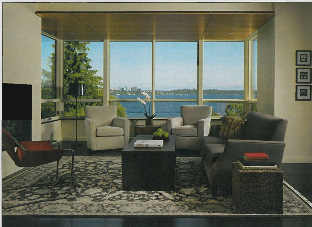
Penny loves the many areas designed with the two of them in mind, a little sitting area in front of the windows faces the still-intimate living room.

Continued from page 15 both Dutch and French.